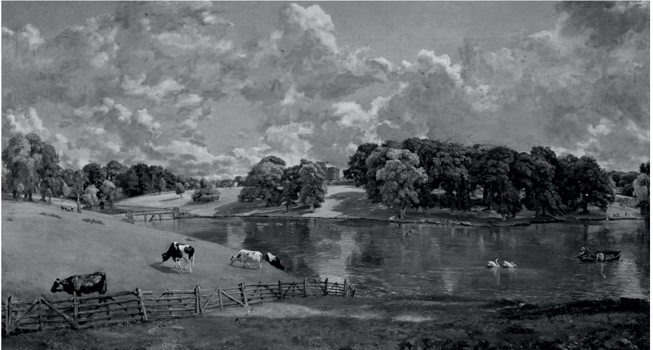
John CONSTABLE (British landscape painter, 1776-1837), Wivenhoe Park (1816) National Gallery of Art, Washington D.C., Oil on canvas, 56.1 cm x 101.2 cm